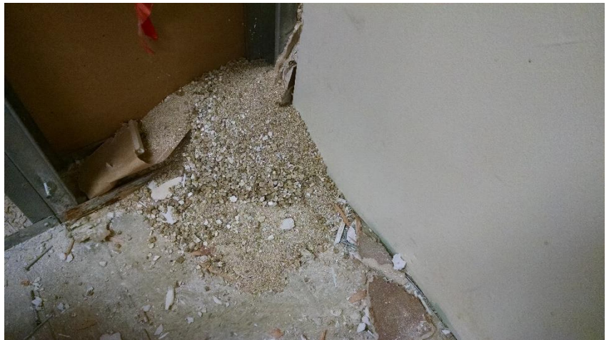
Vermiculite used in wall cavity (above) and floor (below)

When loose-fill vermiculite is installed, asbestos fibers settle toward the bottom over time due to gravity. If a sample of settled material was analyzed, it would not be representative of the asbestos content of the loose-fill vermiculite. Therefore, there is no approved laboratory analysis method for loose-fill vermiculite in New York State. For that reason, if loose-fill vermiculite is encountered during an asbestos survey in New York State, it must be quantified and assumed to contain asbestos.