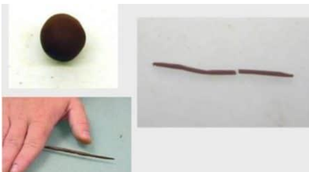
Plastic Limit Test

Plastic limit: The plastic limit (PL) is defined as the water content at which the behavior of a fine-grained soil changes from a semi-solid state to a plastic state and is determined by rolling out a thread of the soil. If the soil is at a moisture content where its behavior is plastic, this thread will retain its shape down to a very narrow diameter. The plastic limit is defined as the moisture content where the thread breaks apart at a diameter of about 1/8 inch. A soil is considered non-plastic if a thread cannot be rolled out down to 1/8-inch diameter at any moisture content.