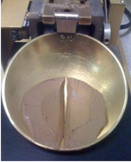
Liquid Limit Test

Soil is placed into the metal cup and a groove is made down its center with a standardized tool of 2 mm width. The cup is repeatedly dropped 10 mm onto a hard rubber base at a rate of 120 blows per minute, during which the groove closes gradually. The moisture content at which it takes 25 drops of the cup to cause the groove to close is defined as the liquid limit. The LL, along with a soil's natural moisture content, is often utilized to evaluate potential foundation settlement due to consolidation of a fine-grained soil in geotechnical foundation design.