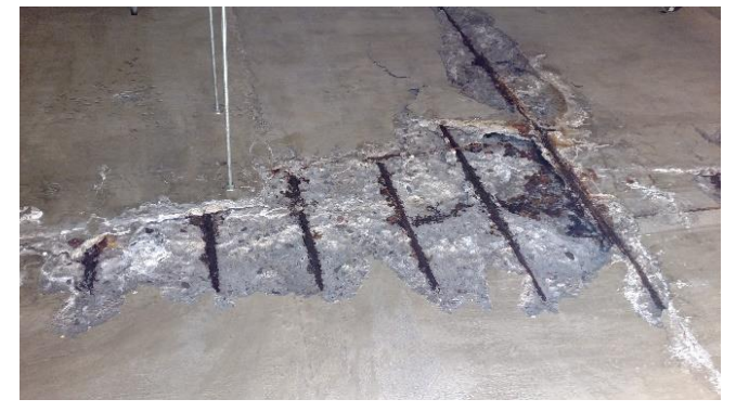
Slab delamination due to reinforcement corrosion.

Sounding is a common method to identify areas of delamination that are not visible. This method is performed by tapping the slab with a hammer or dragging a steel chain across the surface. When problem areas are encountered, the tone will change from a sharp ringing to a dull or hollow sound.