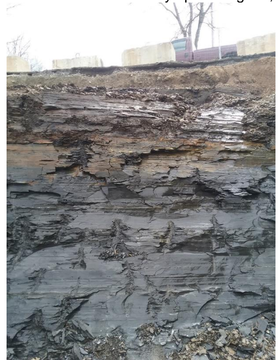
Ordovician Utica Shale Formation Oneida County, NY.

The formation of gypsum within the shale resulting from the weathering of the pyrite causes the shale to expand since the gypsum occupies more volume than its precursor minerals. This effect is more pronounced in highly-