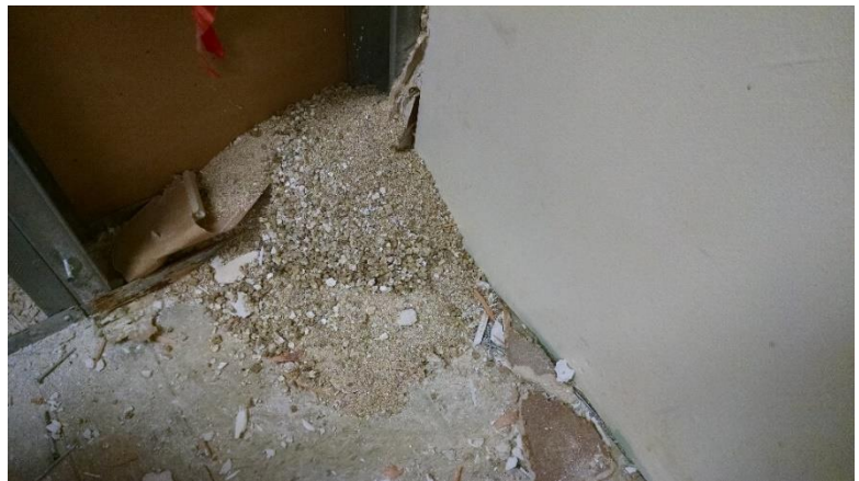
Vermiculite used in wall cavity (above) and floor (below)

Atlantic Testing Laboratories, a WBE Certified Company, provides Asbestos Inspection,