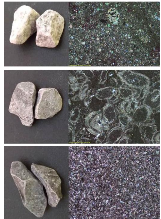
Macroscopic (left) and associated microscopic (right) views of concrete aggregates.