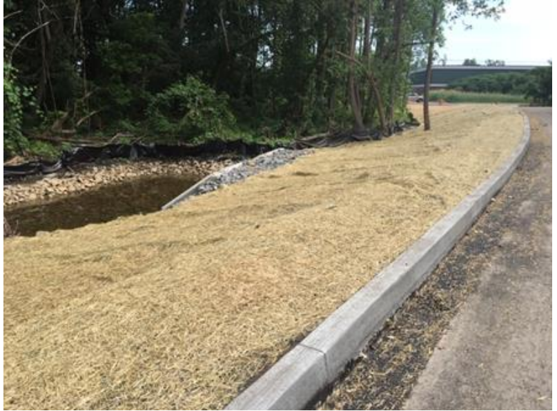
Proper Construction Phase: Rolled straw seed blanket installed following final grading of topsoil.

For more information, contact Kasey Garrand, IG, at 518-563-5878 , info@atlantictesting.com , or visit AtlanticTesting.com .