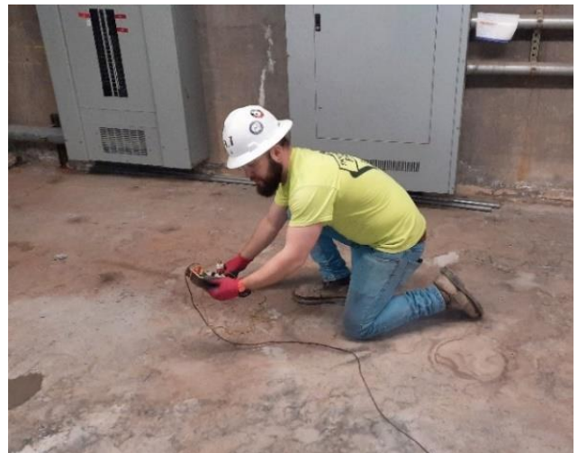
Upper: Ultrasonic Pulse Velocity testing (ASTM C597) Lower: Half-cell corrosion potential survey (ASTM C876)